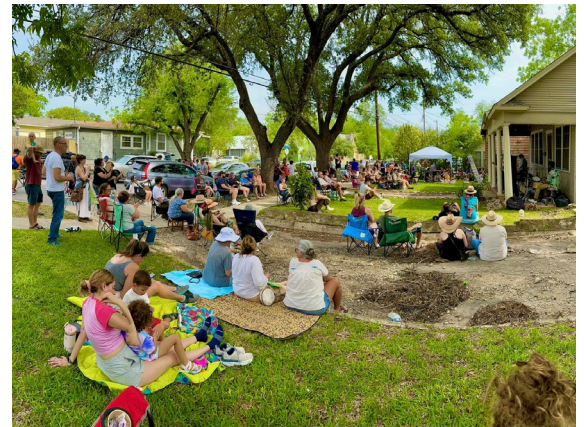
Crowd at Mr. Pidge, Porch 4

PorchFest is a hyper-local neighborhood music festival where porches become stages and yards become venues. We organize a walkable route, with 6 different bands on 6 different porches, throughout Alta Vista and Beacon Hill. Bands start on the hour giving time to meander to the next show. PorchFest is a much-loved event and so full of friendship, community and music!